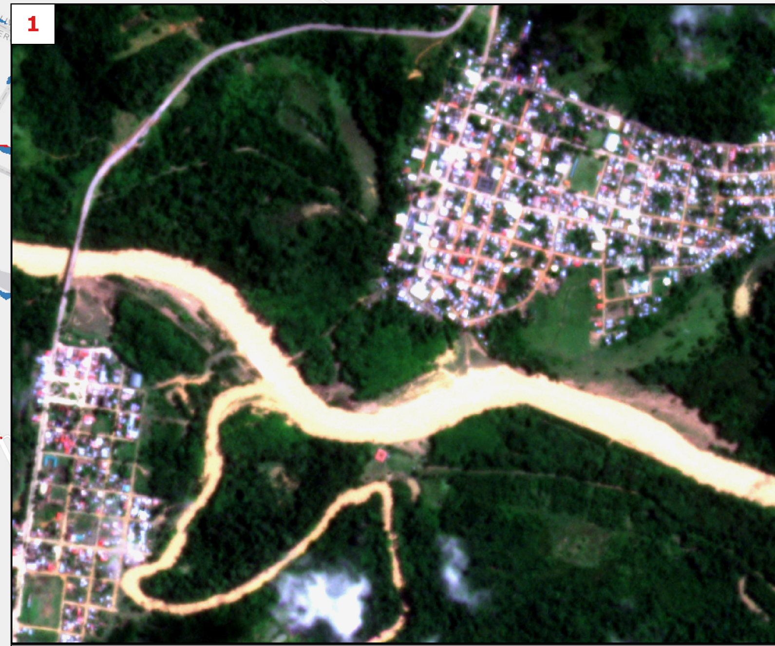
situation after flood, PlanetScope image, 02 April 2023