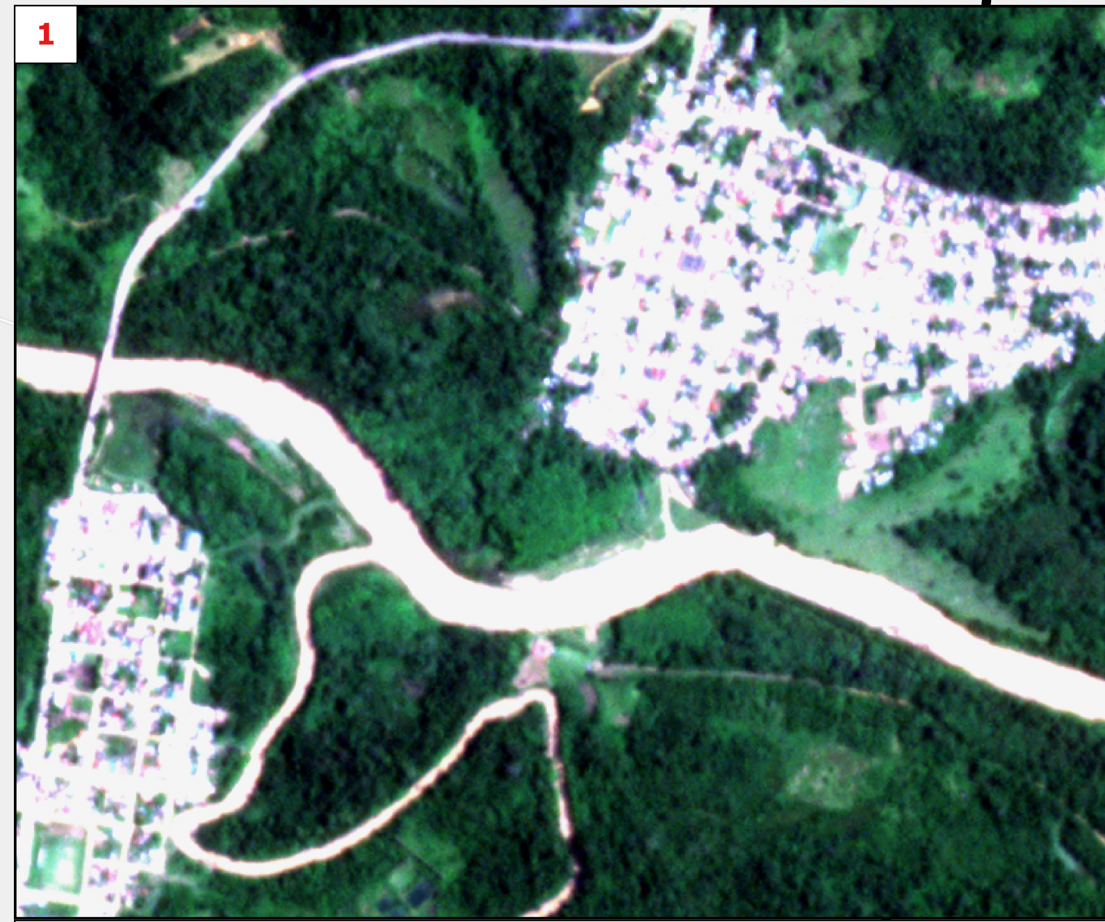
situation before flood, PlanetScope image, 21 March 2023