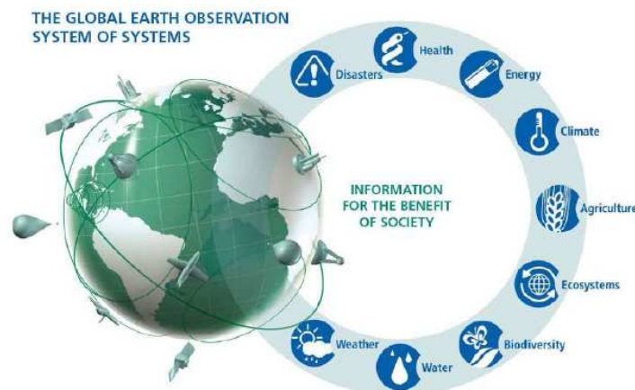
Figure 1. Forest monitoring is a realization of the cross-cutting dimension of GEOSS.

José Achache provided an overview of the GEO Committees and explained the approach and overview of the 2009-2011 Work Plan. He emphasized that existing observing systems show important duplications. At the same time, user requirements point to significant observation gaps, which is a focus of the forest symposium (Figure 1).