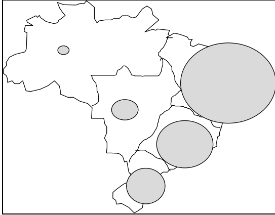
Figure 2 - Result of combination of query results.

We may also be interested in showing this data by means of a bar chart: