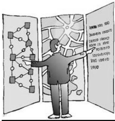
Fig. 2. Vision: GlobalForest would enable multiple perspectives.

fective ways of communicating information about a data processing procedure. Using workflows would be a useful way for GFIS to show the differences between the different data processing tools it provides.